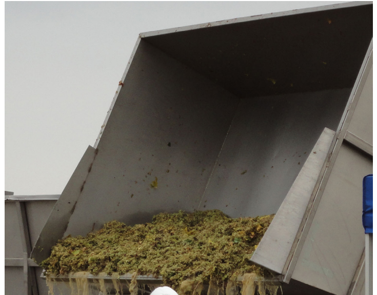
Figure 1. Grape processing for wine and juice production. Crush facilities and wineries need advanced notice of expected yield to ensure adequate supplies are available prior to the start of harvest.

Counting clusters is another necessary activity in yield estimation. Remember, the more vines you sample, the more accurate your estimation will be. Sampling, however, takes time and effort, so a strategy should be devised that allows you to collect a sufficient sample size in a short period of time.