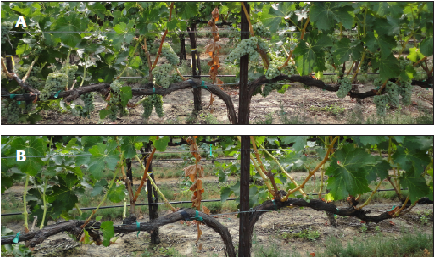
Figure 2. A) Vitis vinifera 'Sauvignon blanc' vine prior to destructive cluster collection. B) The same vine after removal of all clusters. This whole-vine cluster collection can be used to determine average cluster weight, but is not recommended in non-uniform vineyard blocks.

There are several methods to predict vineyard yield that can be conducted during different times of the year, but long-term accuracy requires using the same method(s) consistently.